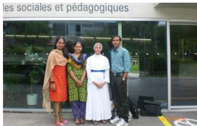
Rajagiri Team at Summer University