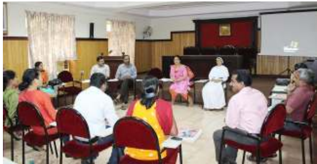
Guides and Scholars during the bi-annual meeting

Bi- annual Meeting of the Doctoral scholars and guides was held on 2 nd August 2014 - 8 Management scholars and 7 Social Work scholars attended the meeting