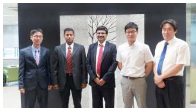
Rajagiri team members with Korean officials