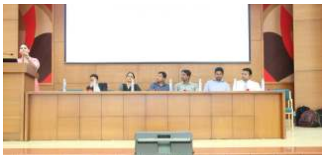
Inauguration of SHRM training

The 1 st session of SHRM training on “Visioning & Goal Setting”. for all junior batches of Kakkanad valley campus was held on July 19, 2014 at RBS Auditorium. The 2 nd session of SHRM training on “Understanding Employers Expectations from a Fresher” was held on August 23, 2014.