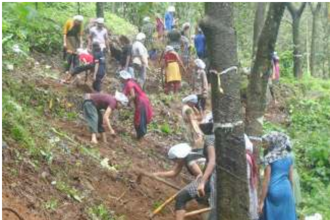
Students actively participating in the camp