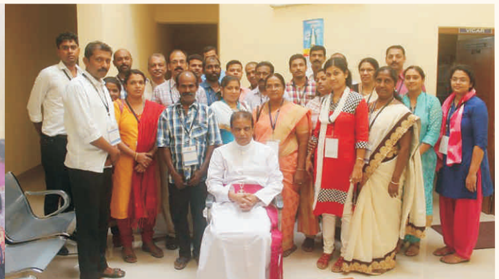
Staff members from both Valley and Hill campuses of Rajagiri College attended the Episcopal ordination.