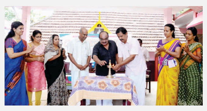
World Aids Day Celebration

Observance of 'International Day of Older Persons' was held in a period between 1<sup>st</sup> October to 5<sup>th</sup> November, 2016. The programme titled as 'Vayovandanam' was held in 14 centers at different areas of Ernakulam, Thrissur, Kozhikode and Palakkad Districts for elderly and 880 persons participated.