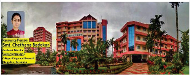
DATE & TIME: 25th July 2020, 7 PM to 8 PM IST

For registration please fill the Google Form - No Registration Fee