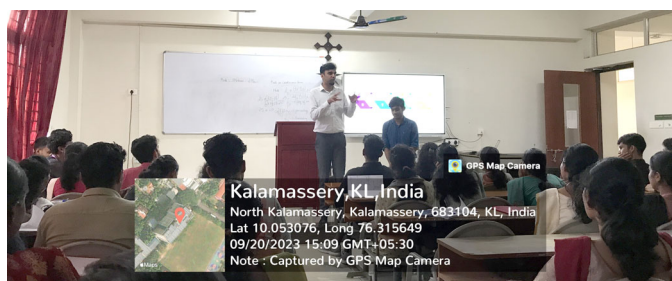
The team from AESTHETIX conducted a coding session on 20th September 2023, where participants learned about

building a resume and being ready for interviews. The program aimed to equip students with essential skills and knowledge to enhance their employability and succeed in the competitive job market. The training included various activities such as group discussions and resume-building exercises.