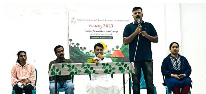
location surrounded by nature, offering a serene backdrop for the participants to immerse themselves in rural life.

The Rural Camp organized for the MCA and MSC (CS)DA 2023–25 batches on 15th December 2023 aimed to provide students with a hands-on experience in a rural setting, fostering community engagement, and promoting a deeper understanding of socio-economic aspects in rural areas. The camp took place at Kalavari Mount in Idukki, a picturesque