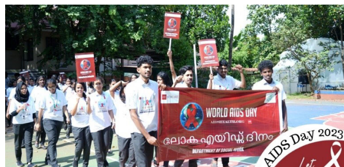
The Department observed World AIDS Day on 1st December 2023 with the theme “Let Communities Lead.” The day was marked by a gathering to listen to this year’s theme and message, followed by a rally within the campus.