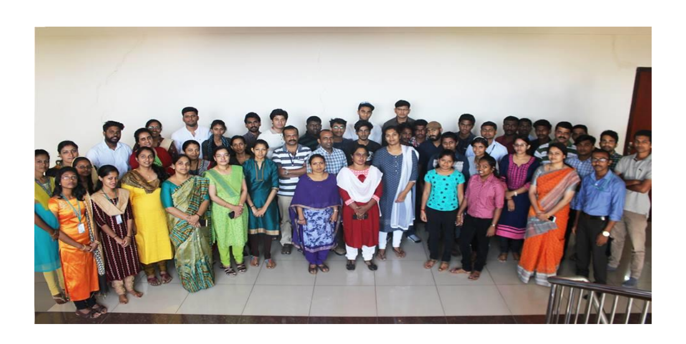
February 16, 2018

Students of Semester 4 and Semester 2 participated in various fests and won may prizes. The details are given below: